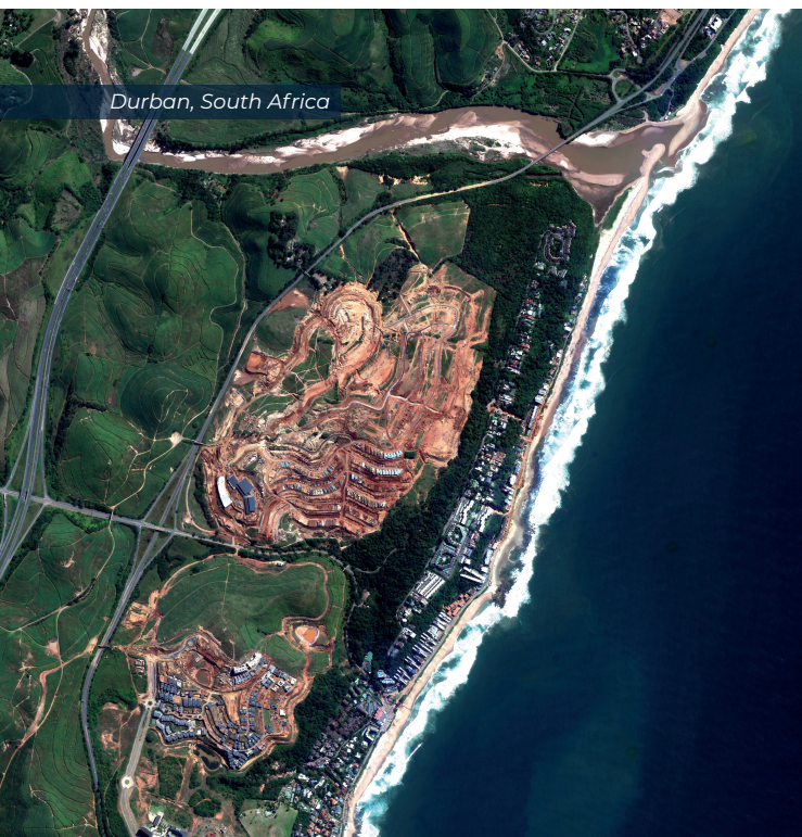
Durban, South Africa

Satellogic is focused on reducing costs, enhancing quality, and increasing EO adoption. We design, manufacture, and operate our own submeter EO satellites. Our current constellation includes 34 satellites.