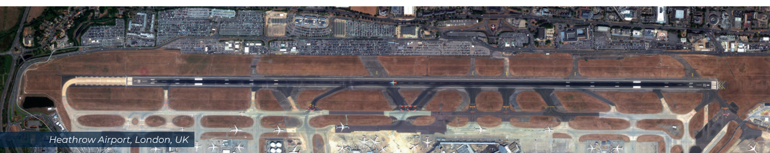
Heathrow Airport, London, UK

Schedule a Q&A with our team at sales@satellogic.com