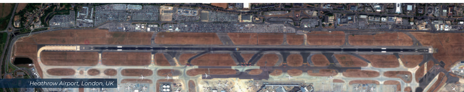
Heathrow Airport, London, UK

Schedule a Q&A with our team at sales@satellogic.com